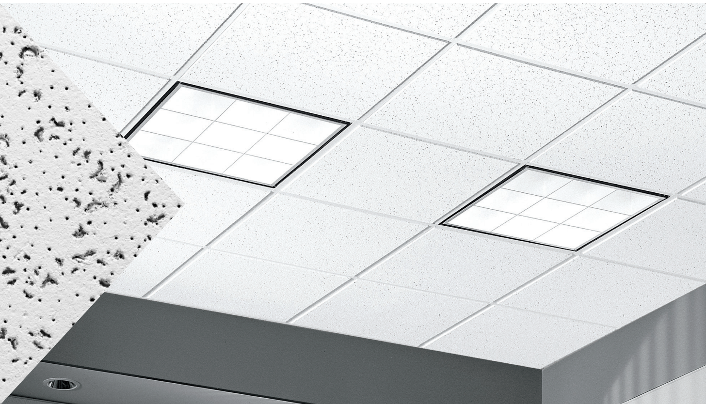
▲ Cortega® Angled Tegular panels with Prelude® XL® 15/16" suspension system

Medium-texture panels; Economical solution with standard acoustical absorption.